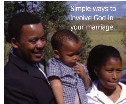
Simple ways to involve God in your marriage.

Q I conceptually know God. But He's not an active part of my life. How can I build this relationship?