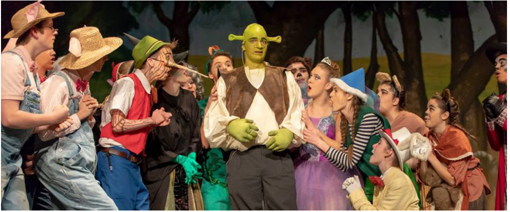
Shrek and Friends