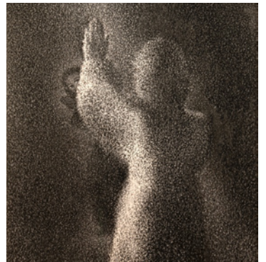
Annunciation to Mary