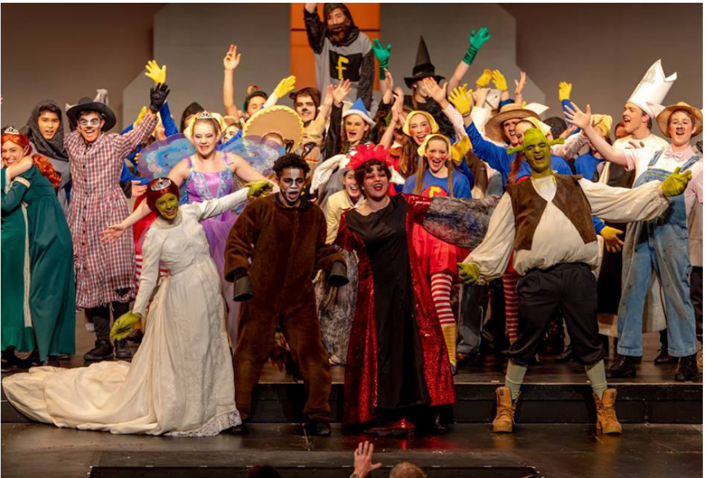
The whole happy crew