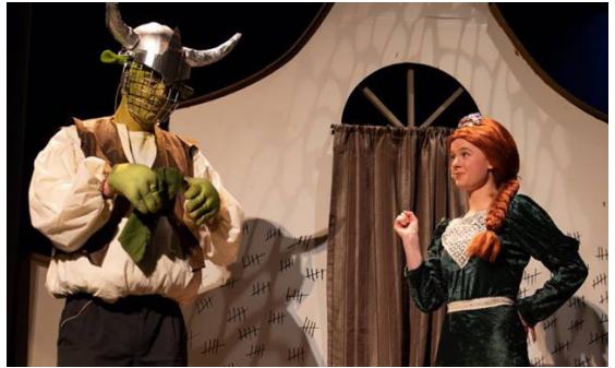
Shrek amuses Fiona