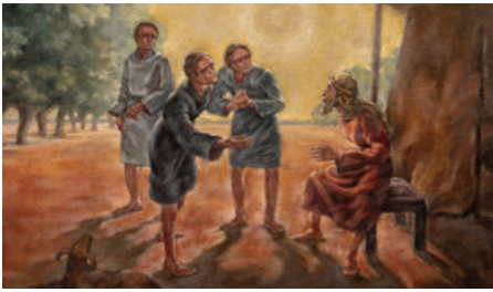
Three Angels Appearing to Abraham