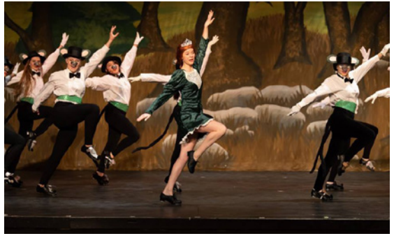
Fiona and the Dancing Rats