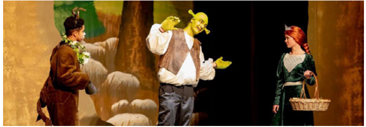
Donkey, Shrek and Fiona