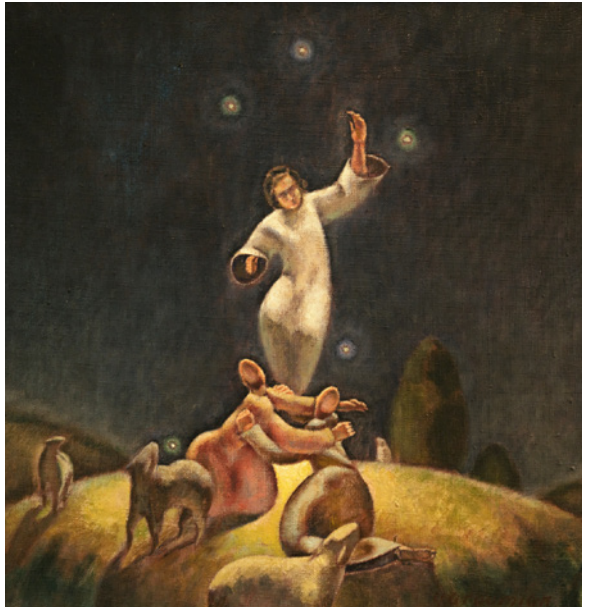
Annunciation to the Shepherds