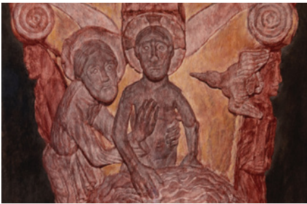
Baptism of Christ