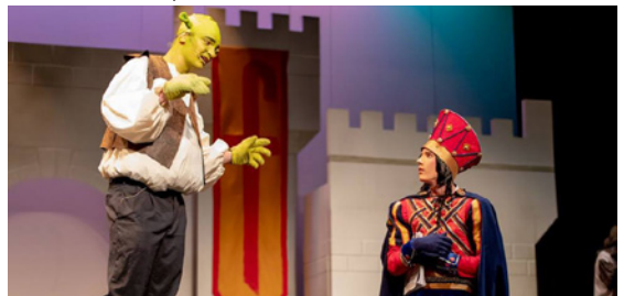
Shrek towers over Lord Farquaad