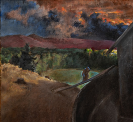
Noah Entering the Ark