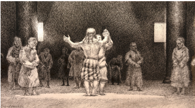
Joseph Revealing His True Identity to His Brothers