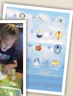
Examples of gifts sent this year: Easter book, June 19th Countdown Calendar, and Easter Sticker project.