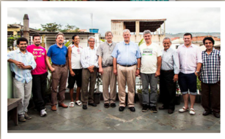
Regional clergy meeting in Brazil.